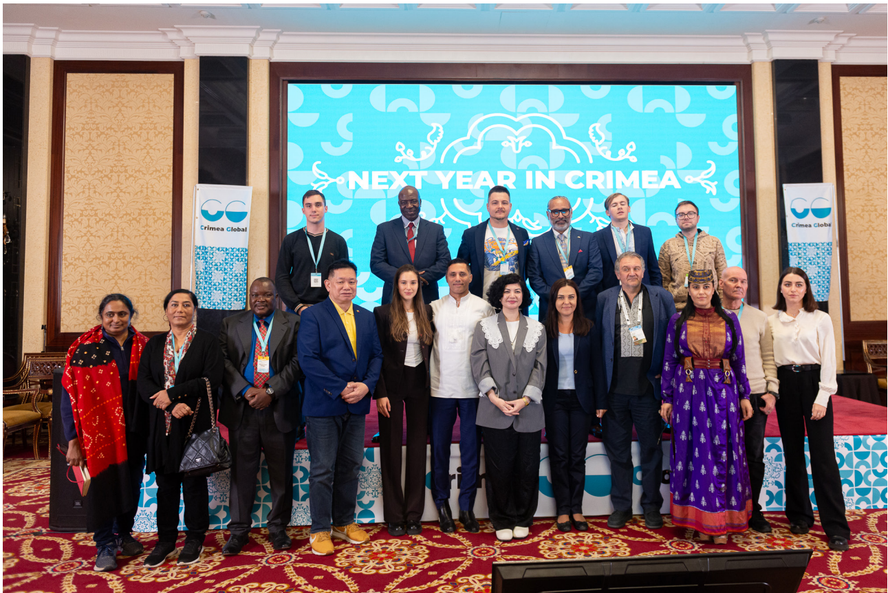
The participants of the international conference “Crimea Global. Understanding Ukraine through the South”, 16 October 2023