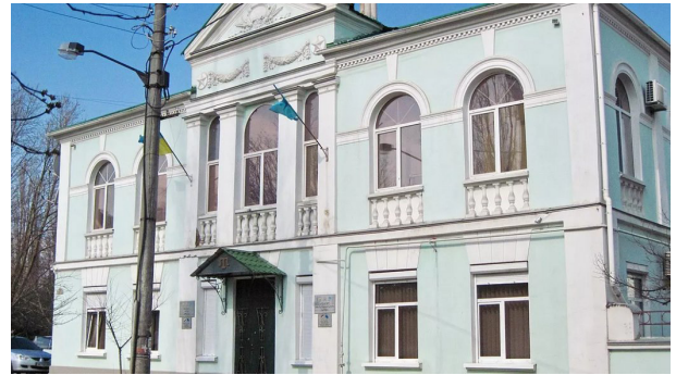
The Headquarter of the Mejlis of the Crimean Tatar people in Simferopol

In 2016, Russia banned the work of the Mejlis of the Crimean Tatar people, the representative body of the Crimean Tatars. The situation was not affected even by the order of the International Court of Justice on provisional measures in the case “Ukraine vs Russia” (2017), which requires the latter to refrain from restricting the rights of Crimean Tatars to represent their interests, including the resumption of the activities of the representative body. On the contrary, in 2023, the occupying administration illegally “nationalised” the Mejlis office in Simferopol, once again demonstrating their disrespect for international judicial institutions.