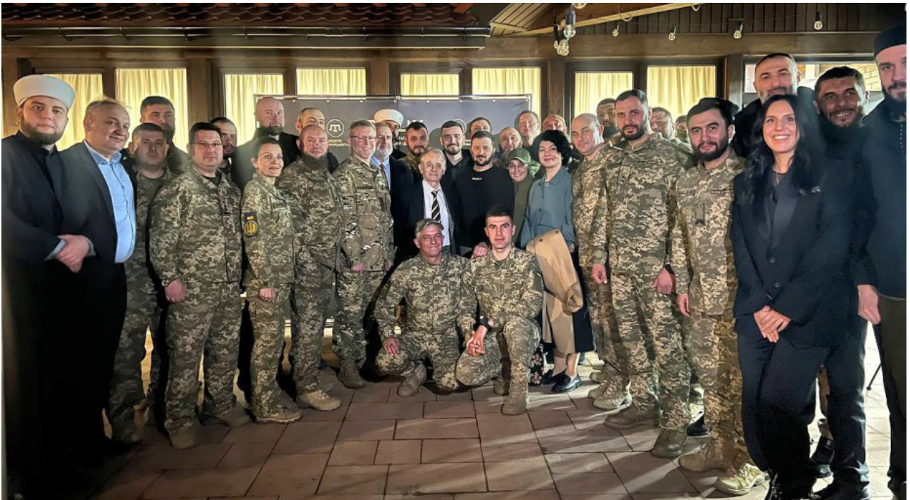
The first official Iftar in Ukraine with the participation of the President of Ukraine, 7 April, 2023

On 18 May 2023, the Day of Remembrance of the Victims of the Deportation of the Crimean Tatar people organised and took part in the meeting of the President of Ukraine with representatives of the Mejlis of the Crimean Tatar people.